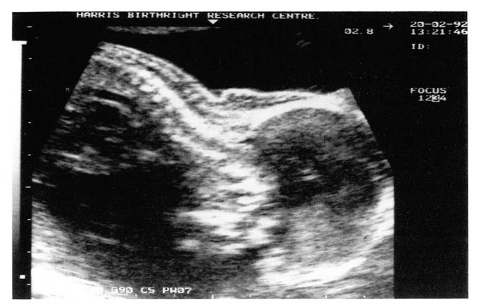
Fig. 1. Midsagittal view of the fetal neck demonstrating nuchal oedema.

One possible explanation for the conflicting results of these studies is that nuchal thickness. which is at least partly dependent on the degree of flexion of the fetal head and the angle of the plane of section of the fetal head [6], does not adequately describe the antenatal finding in trisomic fetuses. In our experience, these fetuses often have nuchal ocdema, which produces a characteristic tremor on ballotement of the fetal head and is best seen in the mid-sagittal plane of the neck (fig. 1). This study examines the incidence of nuchal oedema in a high-risk population of 2,086 fetuses who were karyotyped because of ultrasonographically detected fetal malformations and/or growth retardation. The aim of the study is to determine the pattern of associated malformations and chromosomal abnormalities.